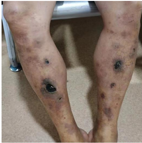
Supplementary Figure 1. Some irregular scabby lesions irregular scabby lesions